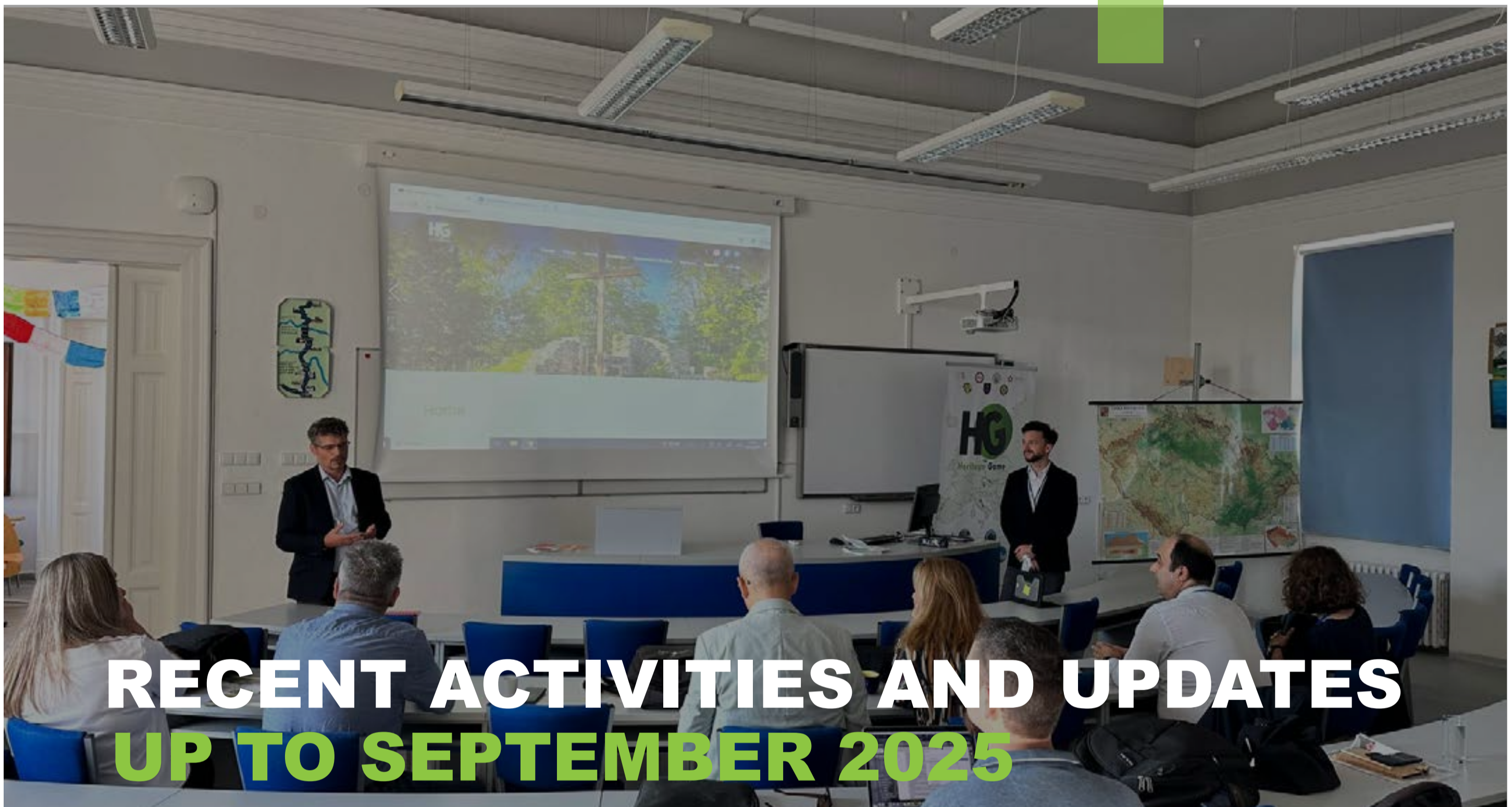
5th Heritage Game in-person meeting at University of South Bohemia, České Budějovice, Czechia.

CLICK HERE to see all partner institutes.